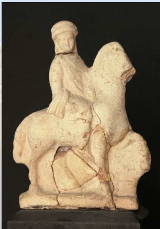
Young cavalry man in Macedonian dress, found in Shatby. Alexandria, Graeco-Roman Museum 10615