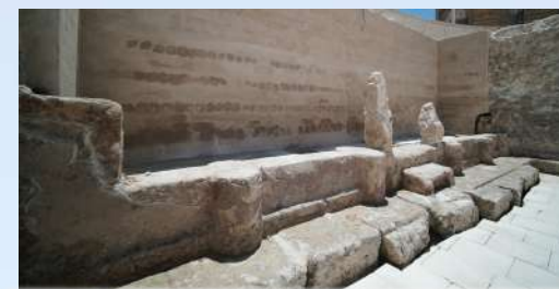
The remnants of the South Façade, discovered in 2021

This unit consists of two chambers. The first hosts 4 loculi in each long side, arranged between Ionic semi-columns. The Ionic doorframes of the loculi were originally sealed with slabs. The back wall of the chamber has a temple-like facade, with a triangular pediment, supported by four Ionic semi-columns. It provides access to the second chamber, which is occupied by two rock-cut sarcophagi in the form